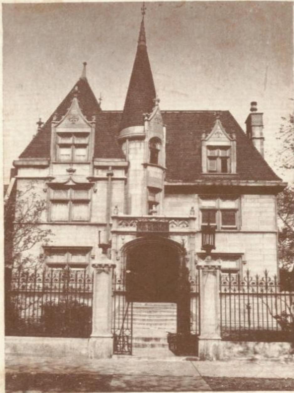
ADMINISTRATION BUILDING PORO COLLEGE