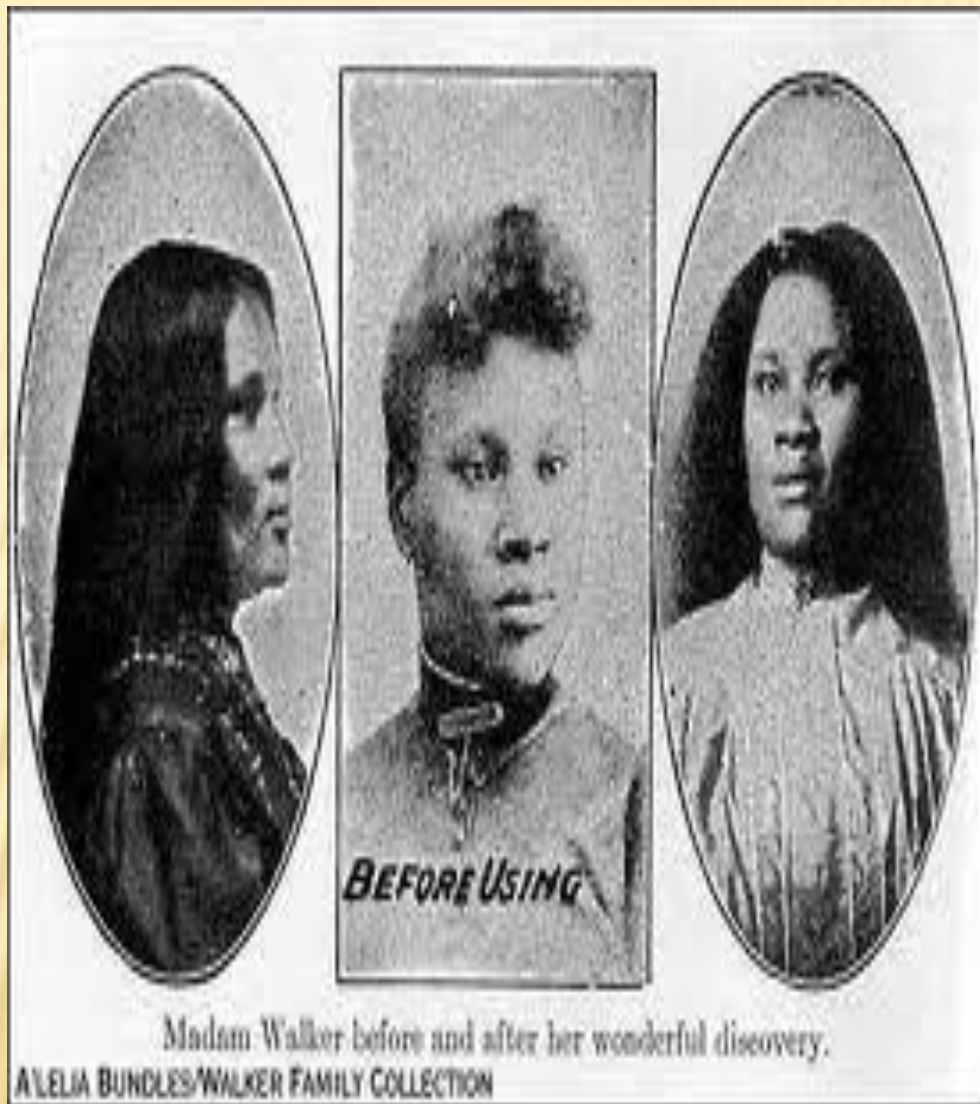
Madam Walker before and after her wonderful discovery.